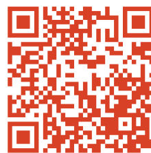
VOLUNTEER SIGN UP